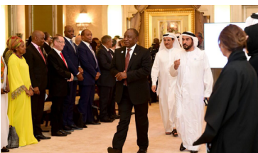
President Cyril Ramaphosa visiting the UAE.

Central to the domestic agenda is inclusive growth through industrialisation and infrastructure. Under the Medium-Term Development Plan, Ramaphosa highlights structural reform, job creation and poverty reduction as key goals. "We must lift economic growth to above 3%," he said in the State of the Nation Address. "To achieve higher levels of economic growth, we are undertaking massive investment in new infrastructure."